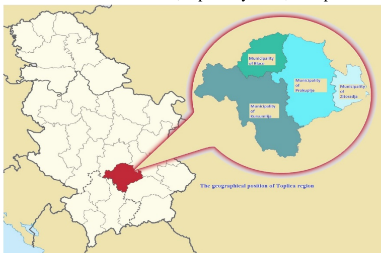
Figure 1 - The geographical position of the Toplica region (model of this picture was taken from the local administration of the municipality of Prokuplje).

Place of Toplica is not unique either in the geological structure or the configuration of the terrain. It consists of two different valleys: the valley of the Toplica River, and the valley of the Kosanica River, as well as several smaller expansions and cliffs in the valleys of tributaries of the Toplica River. In the basin of the Kosanica River, there are mostly volcanic, fluvial and abrasive forms of relief. One of the abrasive terraces, dissected river courses and almost destroyed the Devil's Town. "This is actually a collection of several hundred clay pyramids, built of sandstone and marl, on the top of which are andesite plates, which in the form of caps protect the surface beneath them from taking the end destruction." (J Markovic., 1996). Due to volcanic activity, the area is rich in various minerals, especially mica, feldspar and iron.